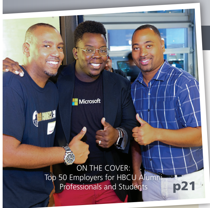
ON THE COVER: Top 50 Employers for HBCU Alumni Professionals and Students